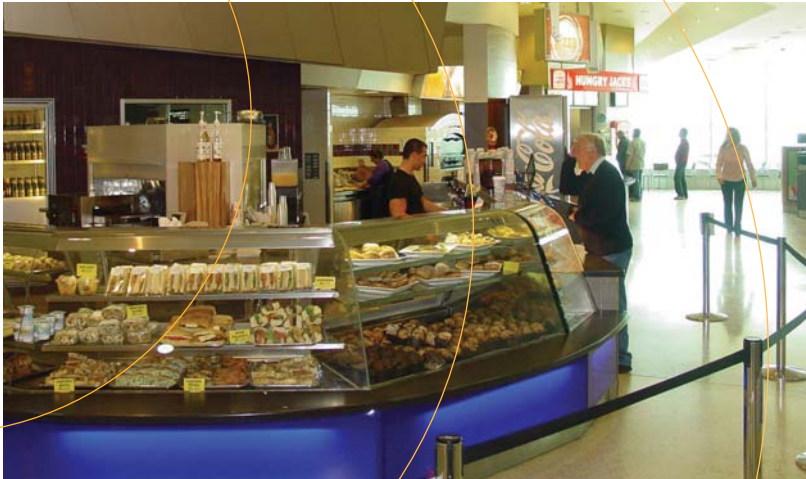
Melbourne Airport, food court