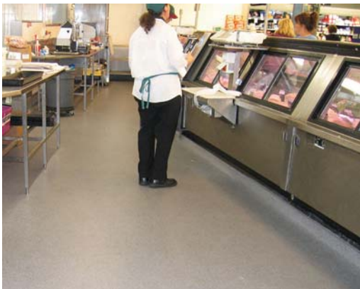
Woolworths Supermarket, Nowra