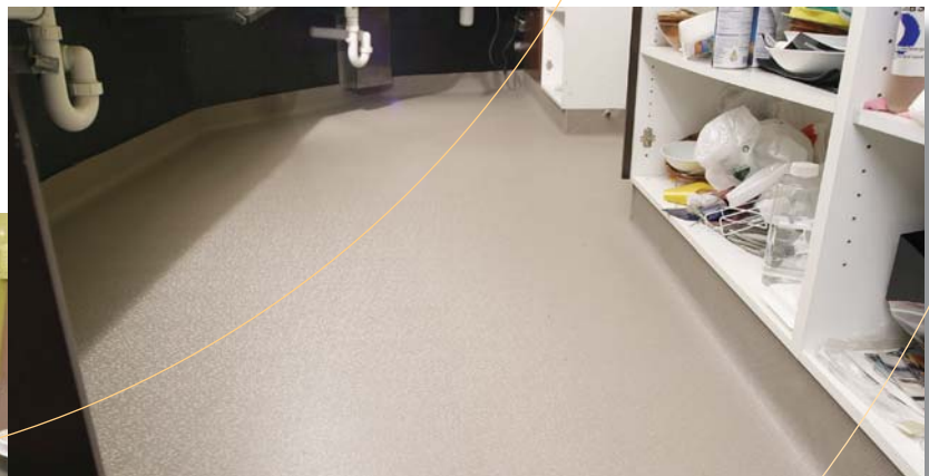
Bar area, after